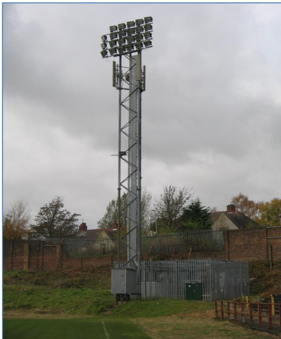
Attached to Floodlight pylon

The following are also to be treated as “Rooftop”