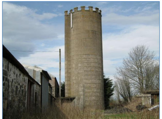
Attached to grain silo