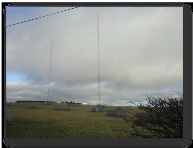
Guyed Radiator Masts