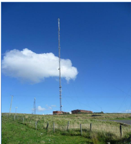
Main TV broadcast Mast (305m)