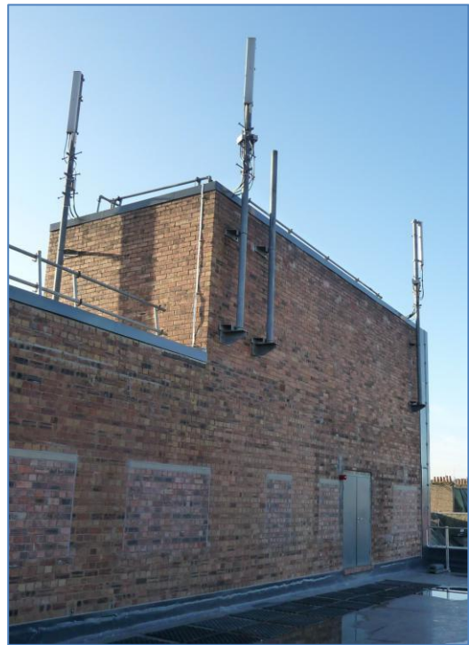
Attached to building

The following are also to be treated as “Rooftop”