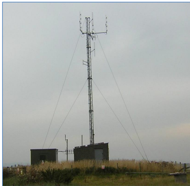
Local Area Broadcast Mast